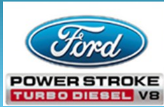
3.0 L, 6.7L Diesel